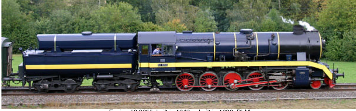
Engine 52 8055, built in 1942, rebuilt in 1998, DLM